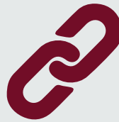
Links to digital enrollment materials